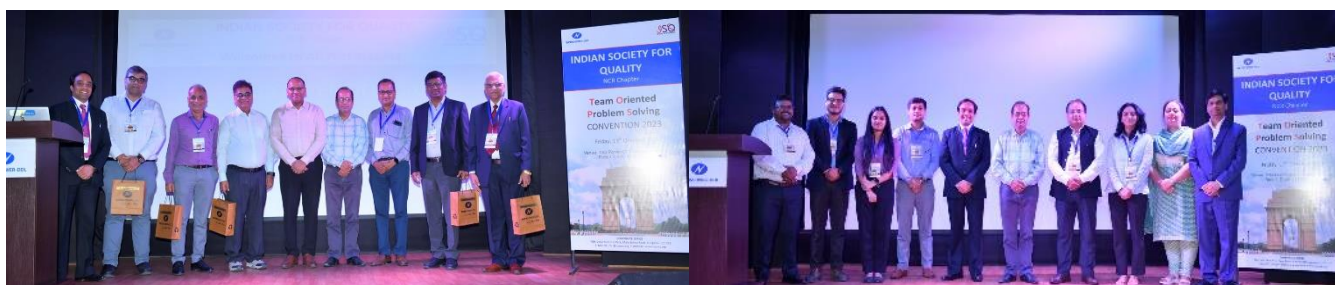
Jury members with Chief Guests