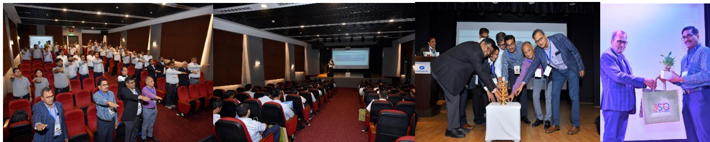
Safety Oath by participants, Inauguration by Lamp Lighting by the Chief Guest, Jury Panel & ED of ISQ