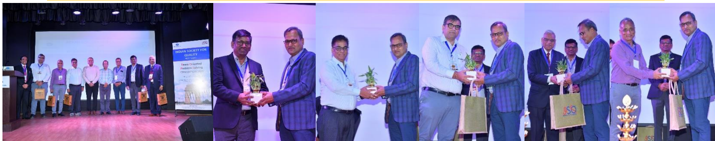
Welcome of Jury Panel with green mementos