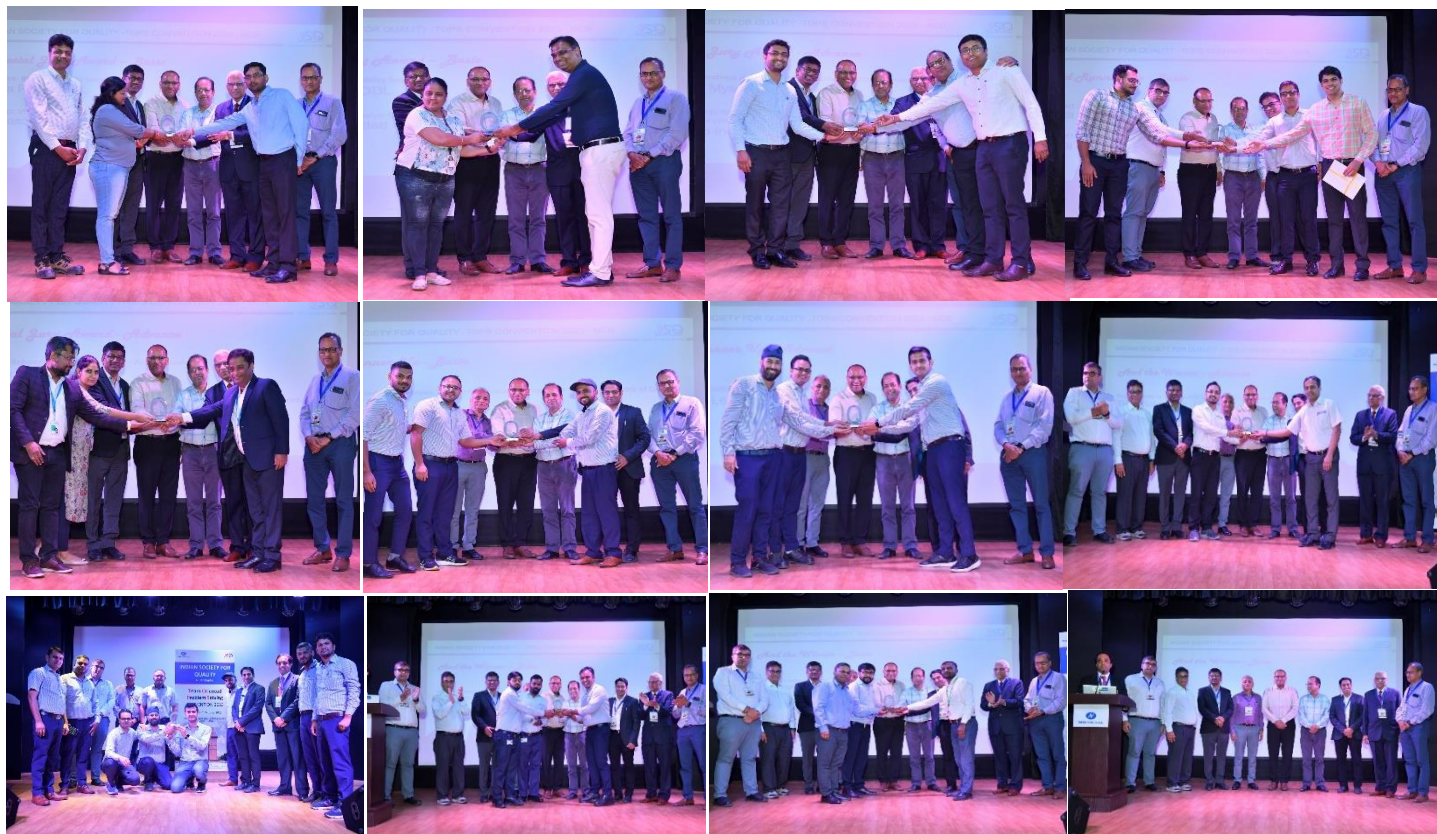
Felicitation of Winning Teams under Basic & advance Category by Guests of Honor and Jury Members