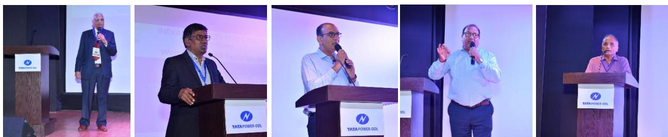
Feedback from Jury members and participants